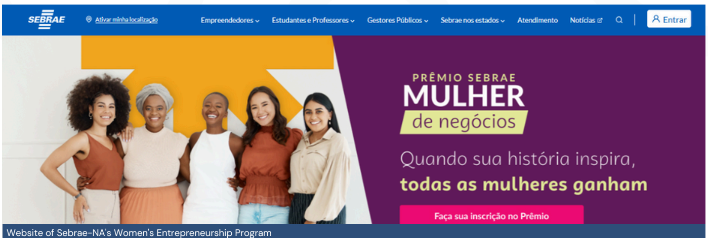
Website of Sebrae-NA's Women's Entrepreneurship Program

The GEM Brazil team has cultivated a long-standing relationship with SEBRAE, particularly through its Strategy and Transformation Unit (STU). To ensure visibility and engagement, GEM Brazil hosts an annual open seminar featuring discussions with academics, programme managers, and opinionleaders. Collaborating with partners such as ANEGEPE (the National Association for Studies in Entrepreneurship and Small Business Management) and SEBRAE also amplifies GEM findings through national media, ensuring broad awareness and impact.